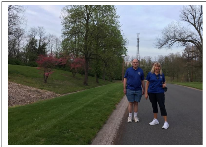
Fun on 3-Mile Thursday evening walk at the Shrine!