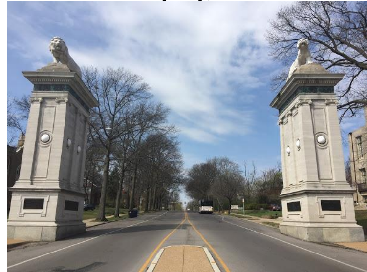
University City Lion Gates

5K Rating: 1A 10K Rating: 1A EVENT: 108003