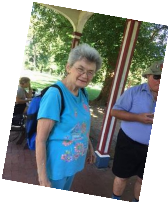
Getting ready to head out on the beautiful walk in Tower Grove Park courtesy of the St Louis-Stuttgart Volksmarch Club.