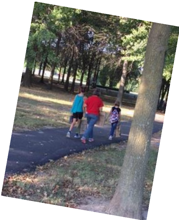
Scavenger Hunt Walk, Swansea, IL.