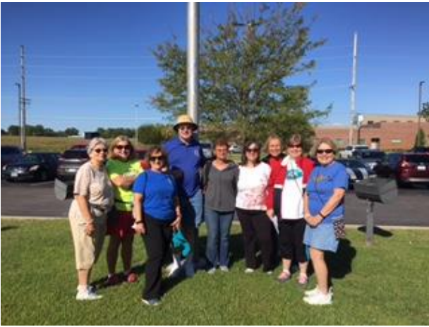
Group walk in O'Fallon IL.