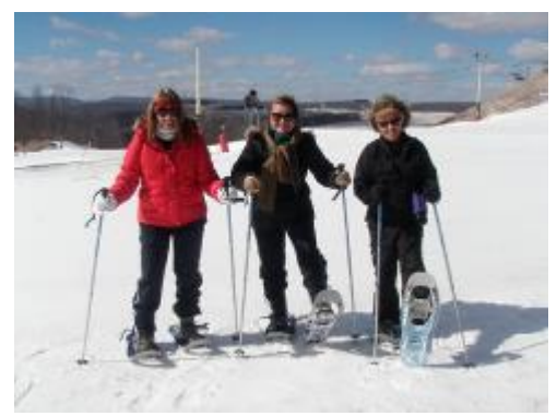
Seasonal snowshoe at the Nemacolin Woodlands Resort in Farmington, PA that will end March 31, 2018 Click on image for flyer.