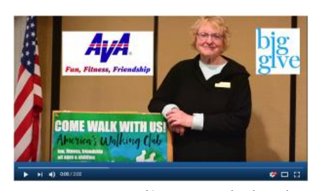
Be sure to stay tuned into our YouTube channel for more Big Give Video messages.