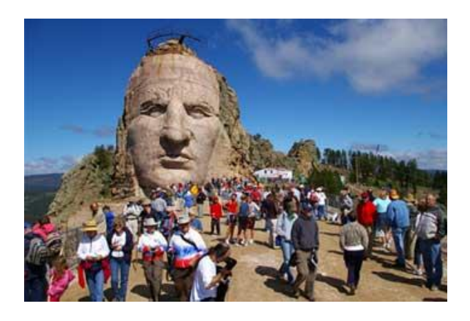
33rd Annual Spring Volksmarch - June 2-3, 2018