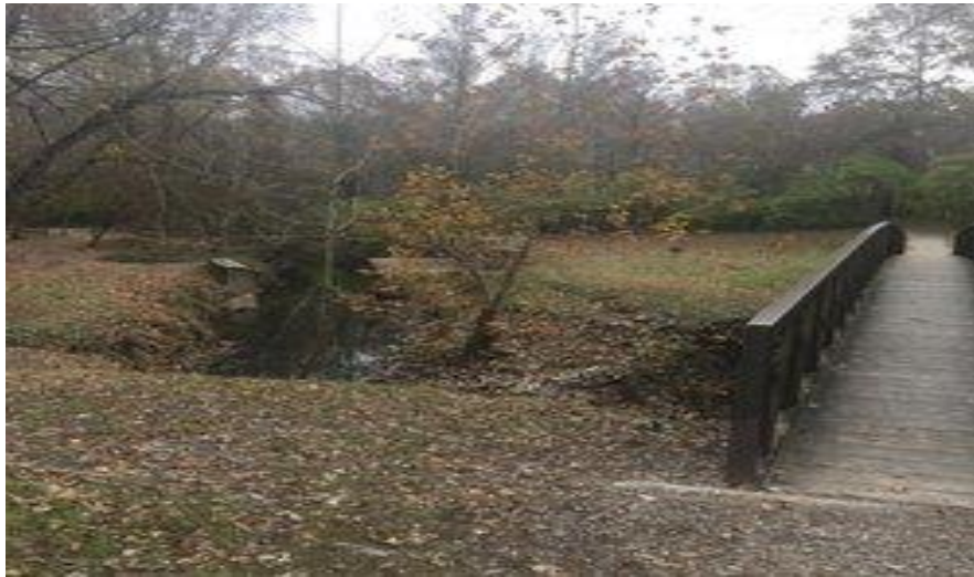
Centennial Park, Swansea

The Illinois Trekkers invite you to walk in Illinois to celebrate their bicentennial. Pack your water bottle and sunscreen! We are walking along the Richland Creek Greenway from Belleville to Swansea and return.