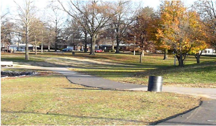
North End Park, Belleville