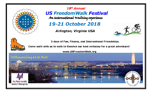
Click on images to learn more.