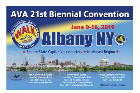
Click on images to learn more.