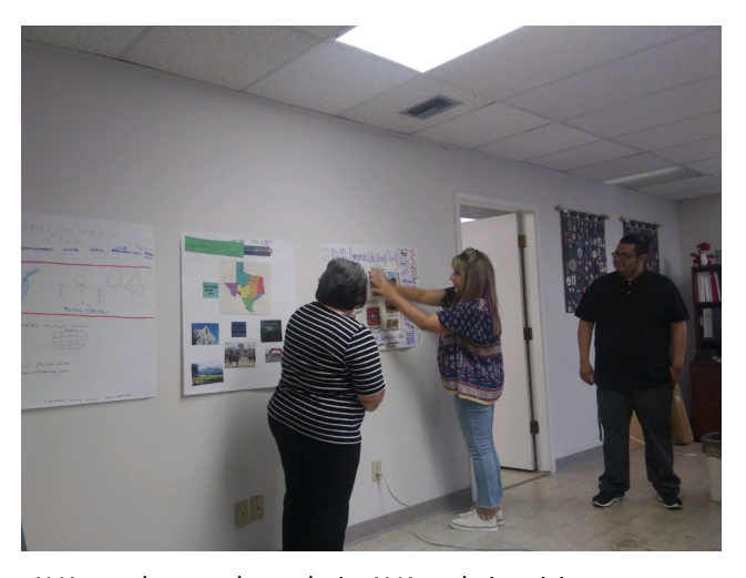
AVA employees share their AVA website vision.