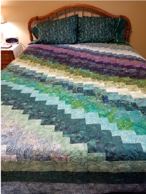
Special Convention Raffle Quilt, Cotton Batik, 90" X 102 Pattern "Trip Around the World" by Eleanor Burns One ticket for $5 • 5 tickets for $20

I must tell you about a beautiful quilt that one of our members, Pat Mahoney, spent many months creating. She has donated this beautiful 100% cotton Batik quilt to our silent auction. This will be a raffle item selling 1 for $5 and 5 for $20. The drawing will be Thursday June 13 th during the convention.