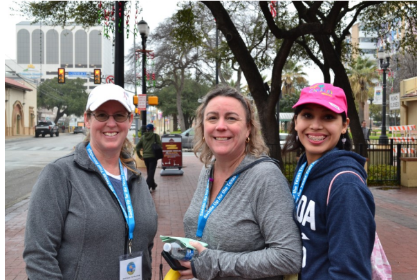
Walking the Texas Trail Roundup February 23, 2019.