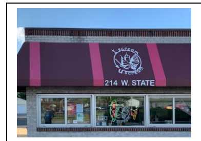
Thursday evening is popular for a stop at the local ice cream shop.