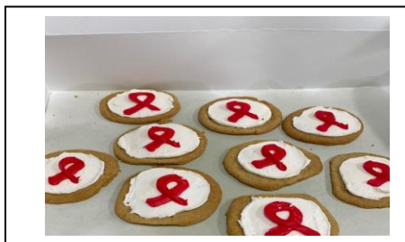
Cookies to help celebrate the event.