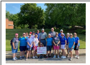
The group before the walk.