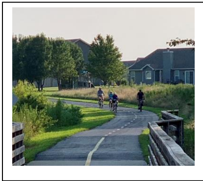
Maryville bike ride