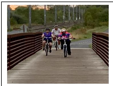
Belleville YMCA bike ride