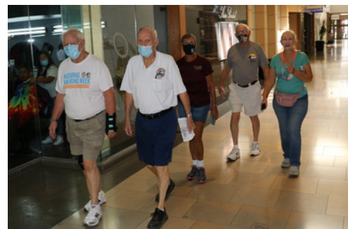
BEAT THE HEAT YRE

I am in search of a couple volunteers from different regions that would like to serve. We are responsible for coordinating and implementing procedures that facilitate the nomination and distribution of awards for clubs, individuals and organizations through the National Executive Council and Executive Director. The committee works in partnership using email and electronic meeting sessions, if needed. Please email me at pa_rd@ava.org if interested and include a brief summary of positions you may have held at club, state or national level. Current committee members are from the Atlantic, Pacific and Northwest regions.