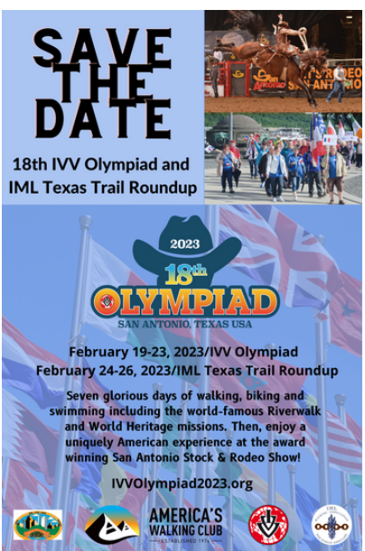
Click image to go to official website.