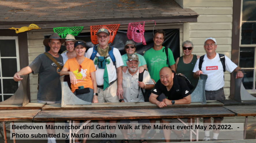
Beethoven Männerchor und Garten Walk at the Maifest event May 20, 2022.