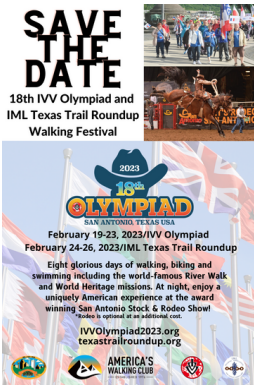
Click on images to view.