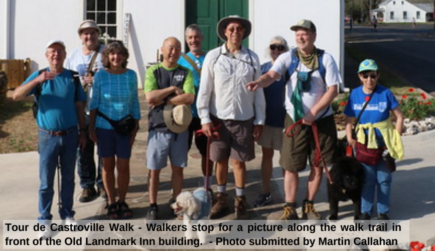
Tour de Castroville Walk - Walkers stop for a picture along the walk trail in front of the Old Landmark Inn building.